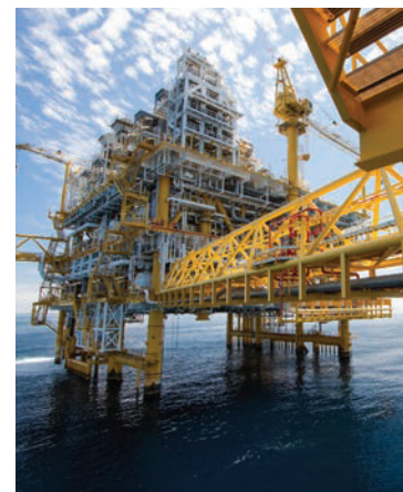
Viatran products are designed to promote oil rig safety at every turn, solving any problems that may occur quickly and easily – with maximum productivity and minimum downtime.

Viatran's substantial expertise in oil and gas allows us to provide outstanding solutions and support upon which you can depend for durable quality and fast service to keep your operation up and running efficiently.