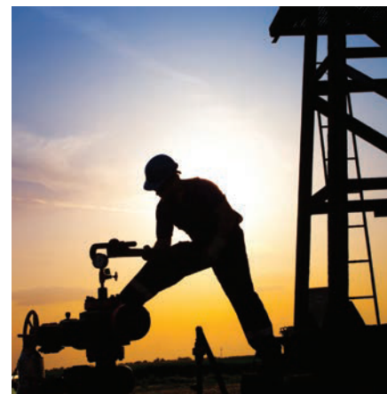
Our rugged pressure sensors and transmitters are renowned for providing robust performance and reliable pressure measurement in the even the toughest environments.