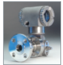
All stainless steel version

The Viatran DP is available with a local display (standard) and optional HART communication (see previous page). All stainless steel housing is also available if needed.