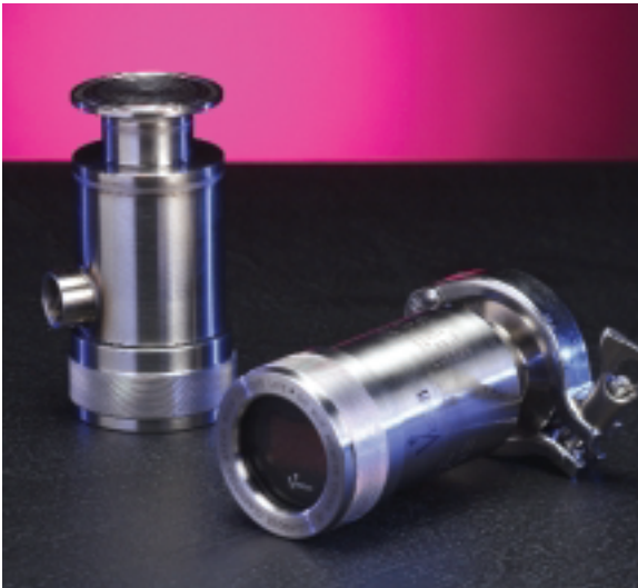
The model X64 from Viatran. HART ready. Standard Hastelloy Wetted parts. Also standard: Viatran's rugged performance and reputation.