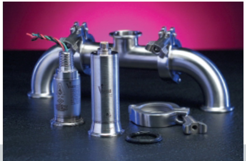
The Model 363 is available with virtually any fitting.

The Model 363 is simple to retrofit. With the unit's high accuracy, quick recovery after a CIP process, internal adjusts, multiple receivers and tri-clamp fittings, the Model 363 is fast becoming the solution for the food processing industry.